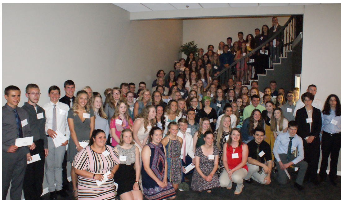
The 2018 scholarship recipients pose on the staircase at D'Mar Banquet Center.